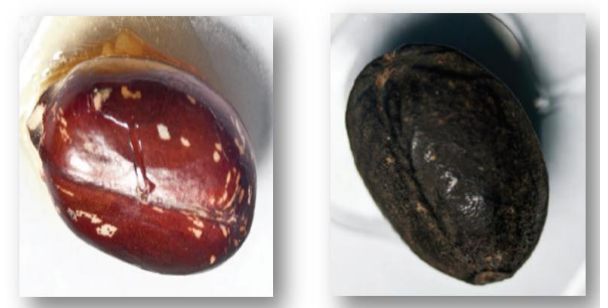
Figure (1): Castor oil seed Figure (2): Croton oil seed

The remnants of the croton plant must be removed from the mouth and to be rinsed with water soon following ingestion. The plant should be photographed or even brought with caution to health care facility for identification so that the diagnosis and appropriate treatment can be delivered. It is also advised not to induce vomiting owing to its strong irritant effect. Seeds or even vomitus may cause blockage of the glottis and suffocation secondary to laryngeal edema. General supportive and symptomatic care are satisfactory to manage symptomatic patients, and no antidotes are available (Poppenga, 2010). Activated charcoal should be administered within two hours after potential toxic ingestion. Endoscopic removal of toxic plant parts can be done in considerable ingestions of highly toxic plants (Kupper and Reichert, 2009).